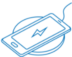
Addition of requirements for wireless power transmitters