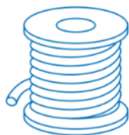
Addition of requirements for fully insulated winding wire (FIW)