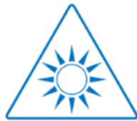
New requirements for optical radiation