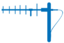
Addition of requirements for outdoor equipment

The third edition of IEC 62368-1 AV/ITE - Part 1: Safety Requirements, published in October 2018, includes the following significant technical changes with respect to the second edition: