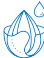
Addition of requirements for insulating liquids