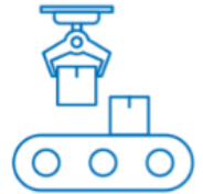
Addition of requirements for work cells